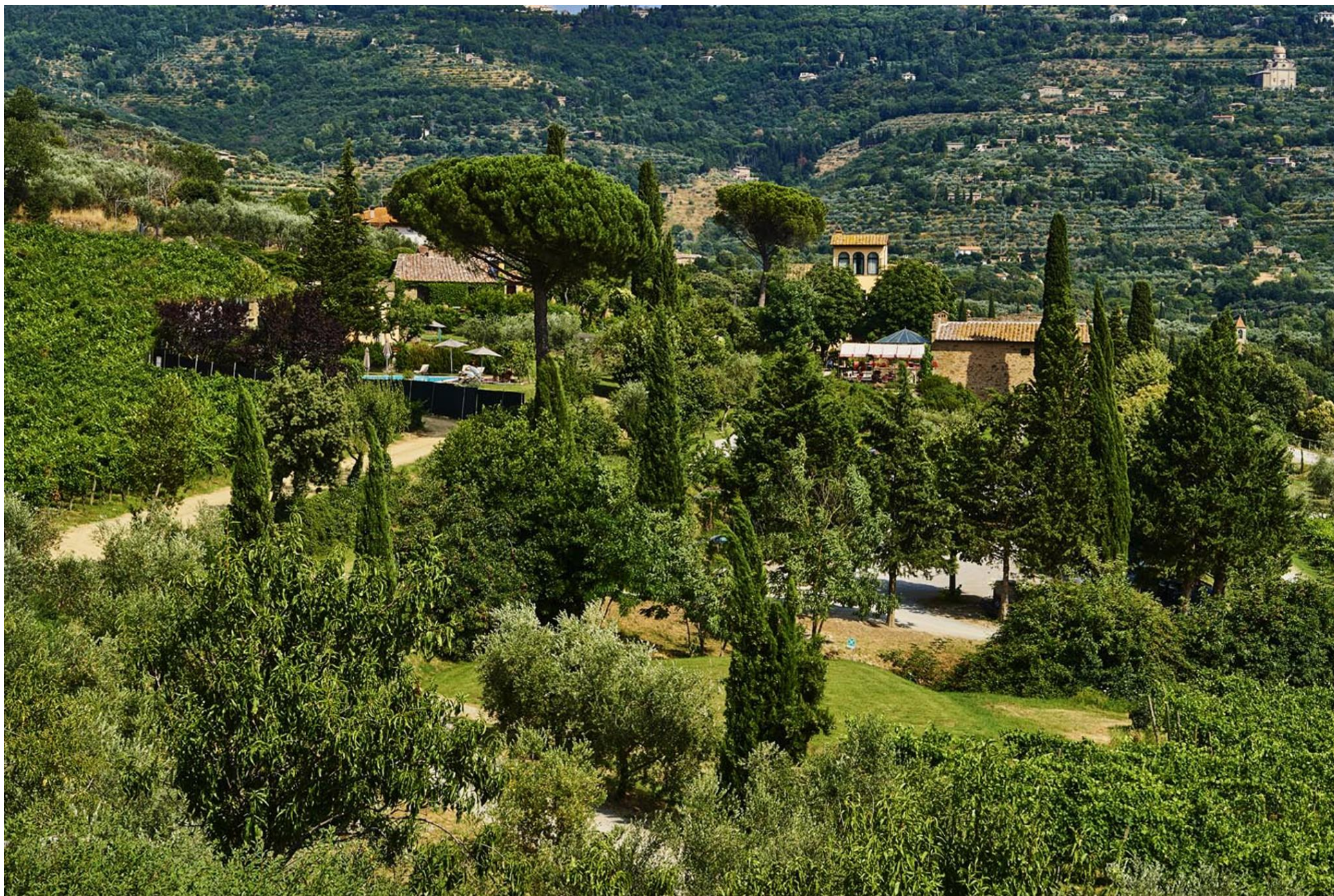
IL FALCONIER E