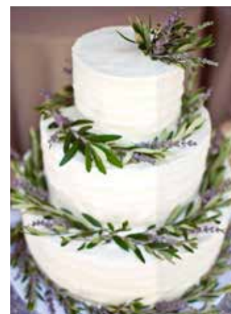
GREEK Wedding Cake