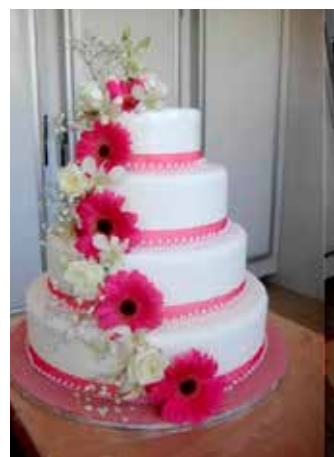
RED Wedding Cake