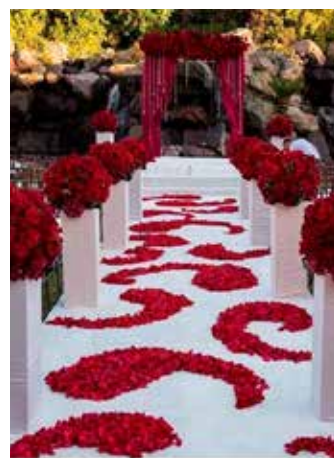
RED Flower Concept