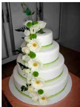
WHITE Wedding Cake