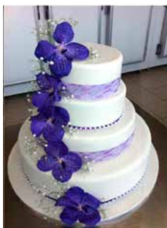
SEA SIDE Wedding Cake