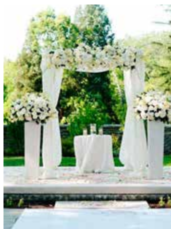
WHITE Flower Concept