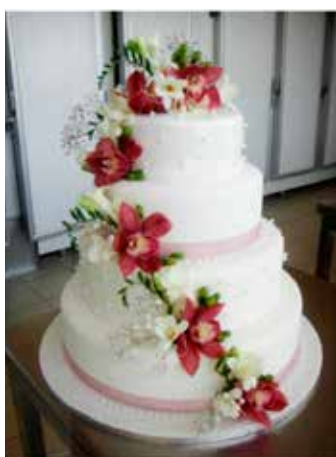
VINTAGE Wedding Cake