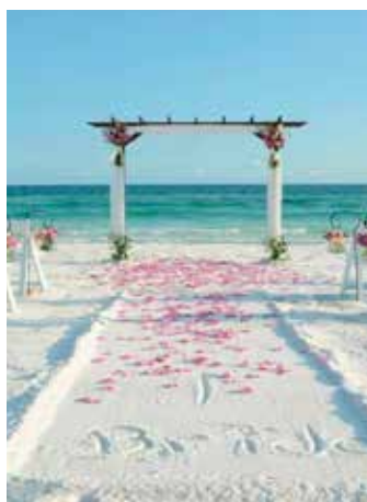
SEA SIDE Concept