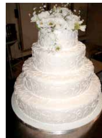
DANAI Wedding Cake

Customized wedding cakes from our Pastry Chef are available