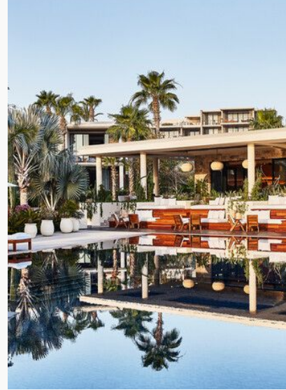
YAYA RESTAURANT & BAR