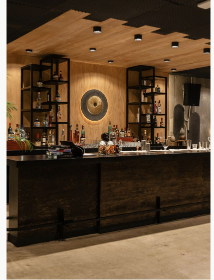
THE BAR DOWNSTAIRS