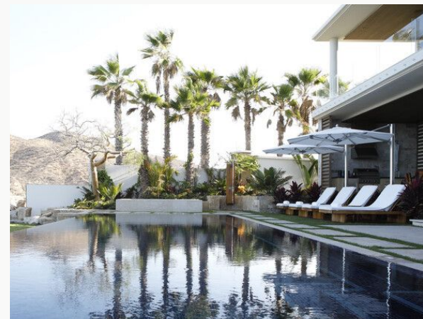
BRISA DEL MAR