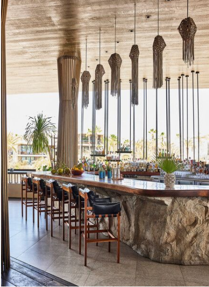
COMAL RESTAURANT & BAR